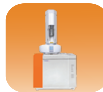
Optima Gas Chromatograph