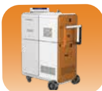
Helium Mass Spectrometer Leak Detector