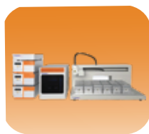
Automated Prep-Flash Chromatography system